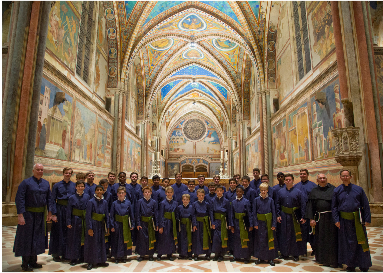
Basilica of St. Francis of Assisi, Assisi.