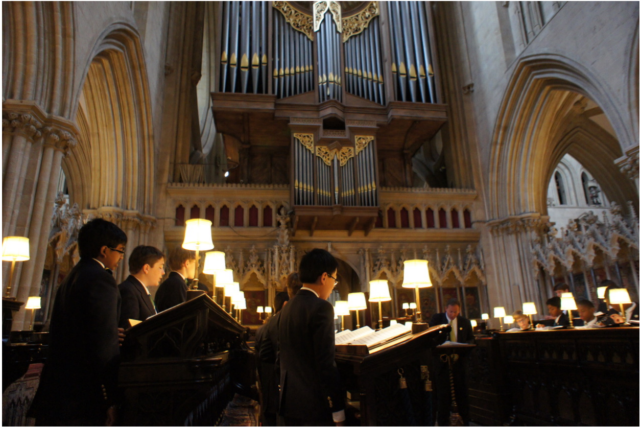
Wells Cathedral, Wells.