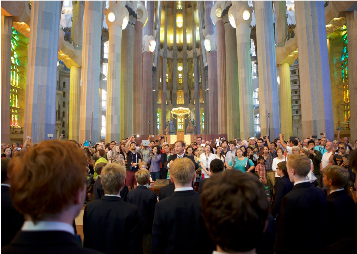
Sagrada Família, Barcelona.

Interlochen Center for the Arts in Interlochen, Michigan as well as the Csehy Summer School of Music in Philadelphia.