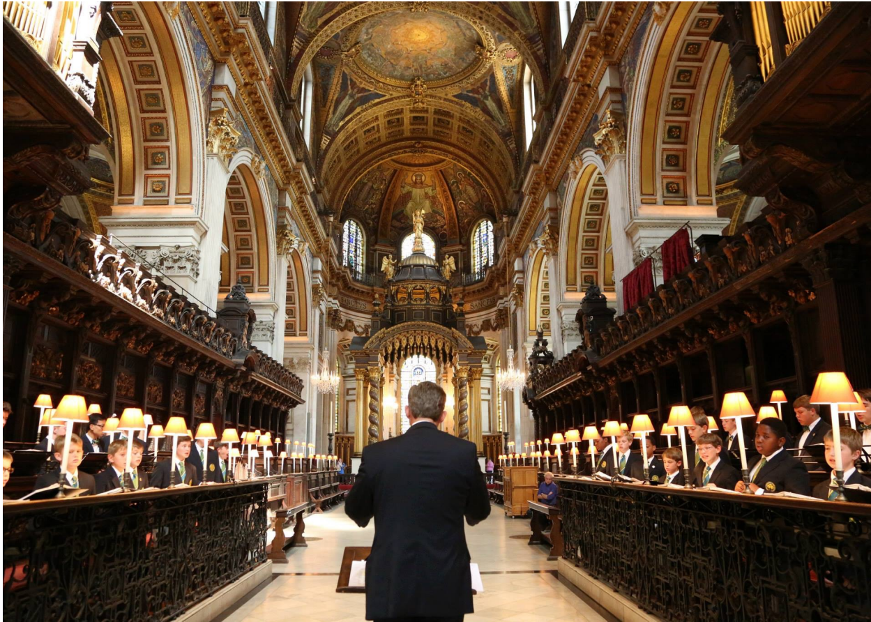
St. Paul's Cathedral, London.